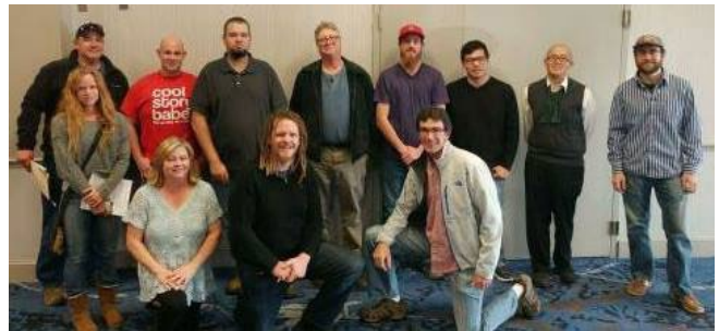
First time attendees to COSALC State Training